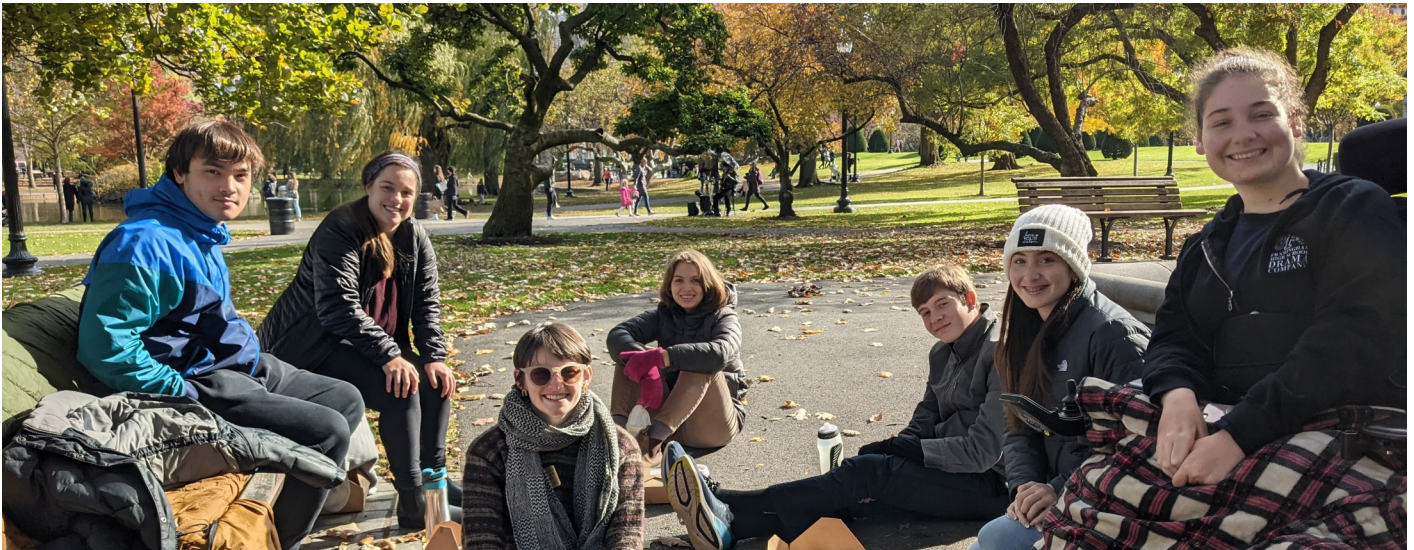
Old South's Youth Group met outside for most of the fall of 2021