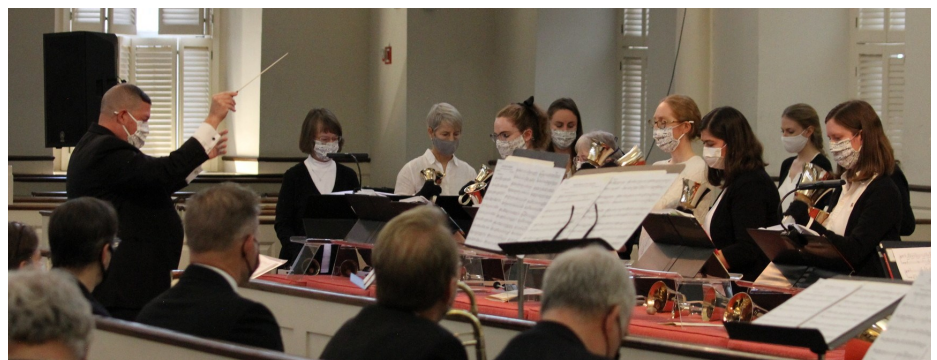
The Old South Ringers at Meeting House Sunday

The Old South Ringers had a very good year overall. In the winter and spring, the Ringers continued their pre-recorded contributions to the online worship experience. Not only were more members of Old South exposed to our handbell music and ministry, but many of the Ringers' recordings were picked up by other worshipping communities, allowing the Old South handbell program to touch a far greater audience than we otherwise could have reached. In the fall, the Ringers saw a significant increase in their membership thanks to several new members joining and due to the return of several members who had taken a leave during the first year of the pandemic. The Ringers continued their monthly contributions to worship and were especially pleased to