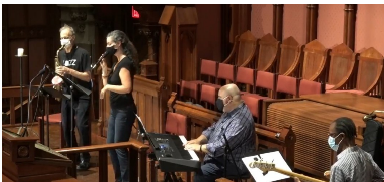
A socially distant Jazz Ensemble returned in-person to the Sanctuary in September.