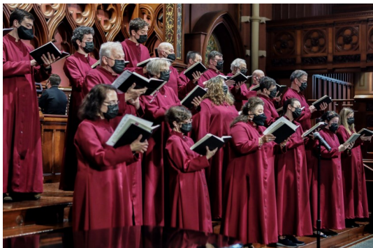
Old South was happy to return to the chancel.

As we began to pivot toward in-person worship toward the close of the summer, I was delighted to participate in Old South's All Church Worship Watch Parties—a bridge between All Church Virtual Worship and the hybrid All Church Worship which succeeded it. The Old South Ringers and Festival Choir both resumed regular, in-person rehearsal the week following Labor Day, with Gospel Choir returning shortly thereafter. Because of the ongoing risk associated with the pandemic, Old South instituted several risk mitigation policies during this period. These included requiring all music ensemble participants to be fully vaccinated, requiring masks for all indoor activities (including singing), social