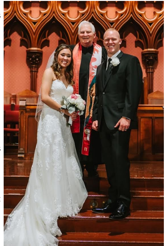
The wedding ministry at Old South is certainly a joyful one!