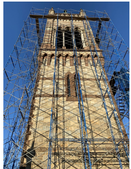
Erection of the Tower Project scaffolding was not complete until late August.