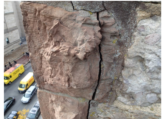
A crack at the one of the corners that needs to be rebuilt

As unknown determinants are inherent in a project of this sort and magnitude, the scope of the project continually changed as work progressed.