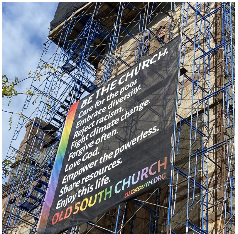
Tower construction may have marred our aesthetic temporarily, but Old South's message remains clear!