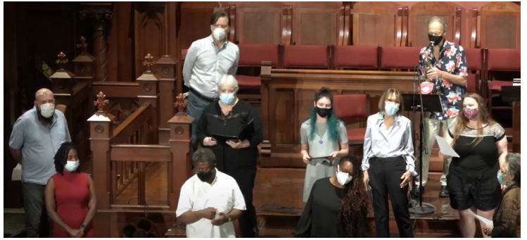
A socially distance Gospel Choir singing at the Jazz Worship Service