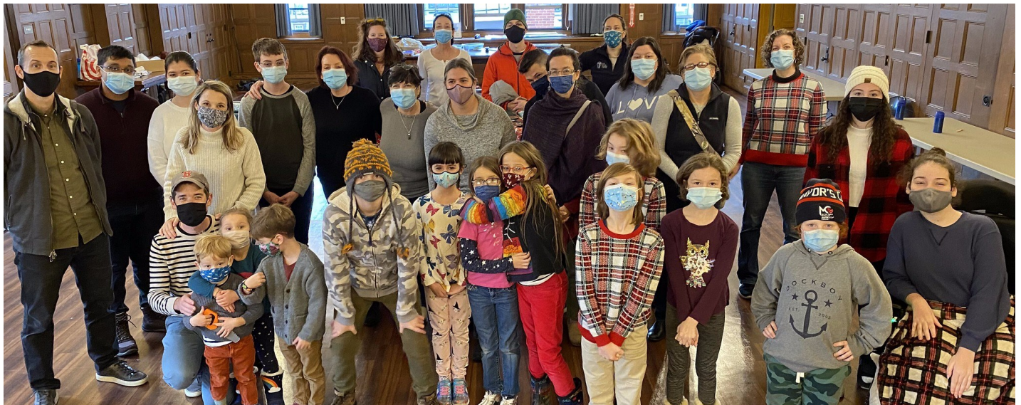
The Advent Family Service Project had a great crew this year.