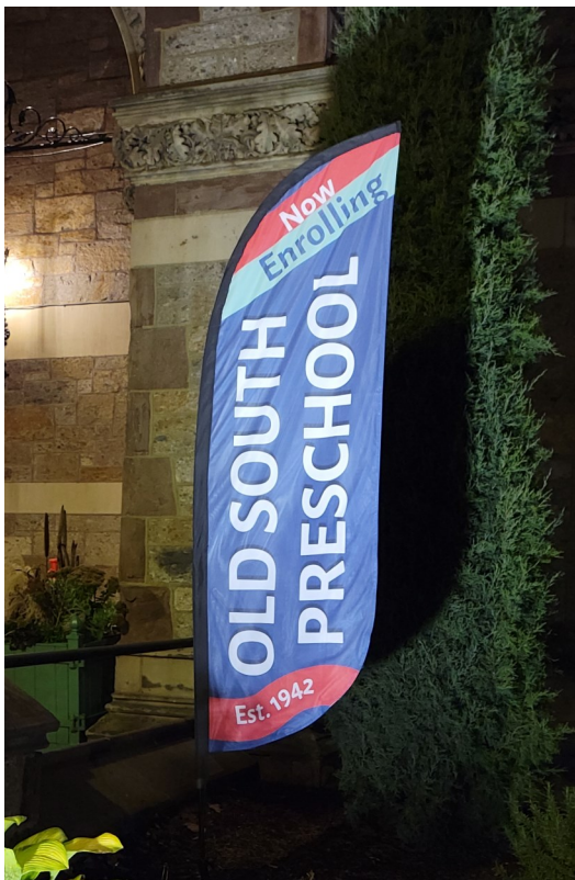
Feather banners in front of the Church publicize our Old South Preschool