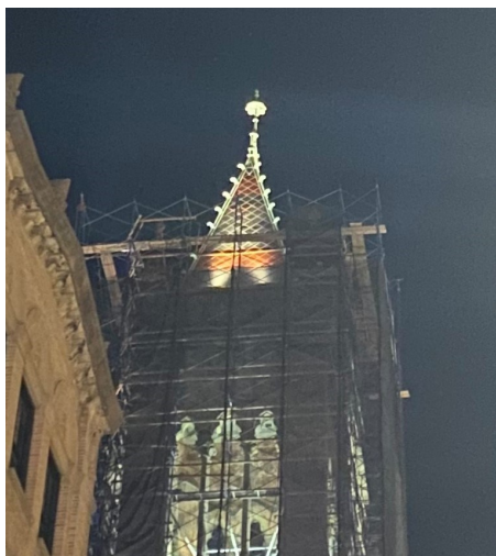
The steeple lights will shine brightly for the next 10-15 years.

Because our grand front entranceway and our street facing sign board were concealed by scaffolding for the duration of this project, we used this opportunity to hang a 21x21 foot banner from the scaffolding with the United Church of Christ's "Be the Church" motto. In addition, work was put into creating sign boards for display in the narthex of the church that showed the history of Old South's "two towers" (the first having been built in 1875 and the second and existing tower in 1937) and explained the scope of the work currently taking place.