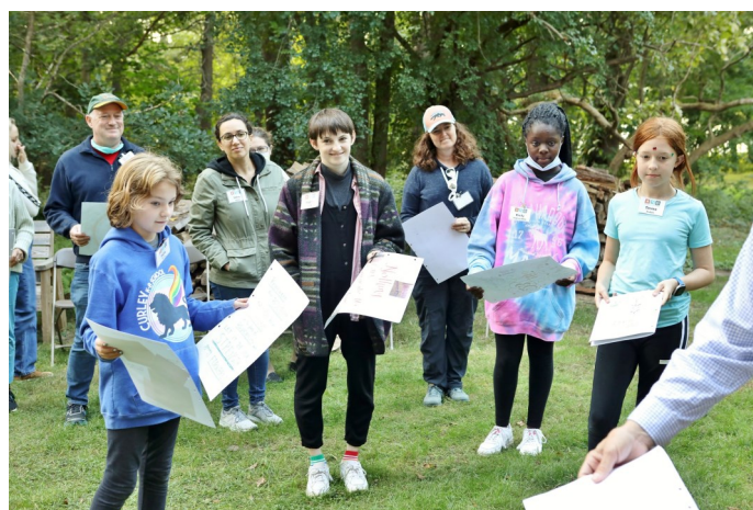
The All-Church Retreat was a very successful one-day outdoor event.