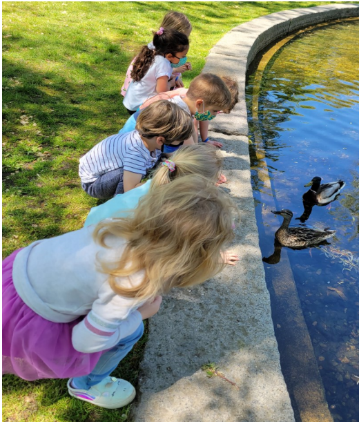
Top: a visit to the Boston Common, Below: gazing at the beautiful paper cranes in Old South's portico.