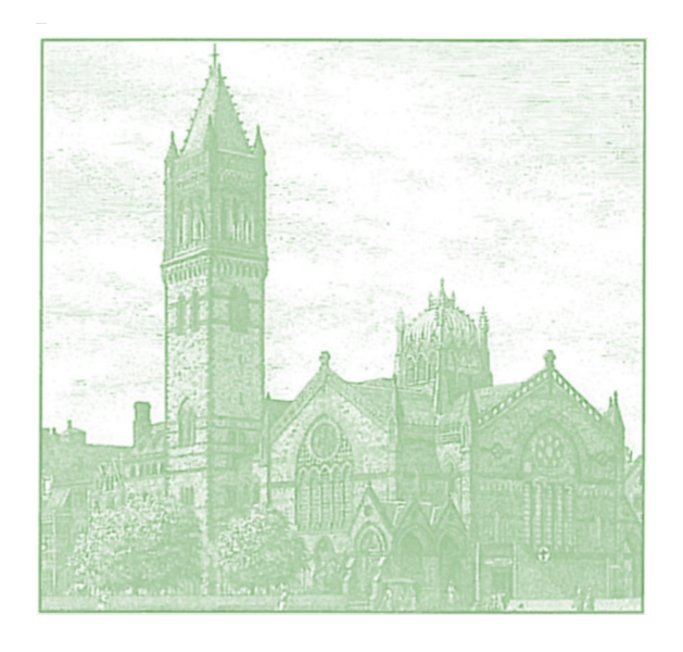
Old South Church Copley Square, Boston A Congregation of the United Church of Christ Gathered 1669