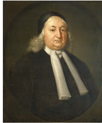
Old South member, judge and diarist, Samuel Sewall