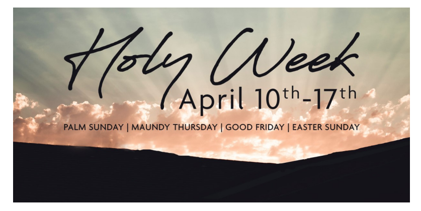
Our Holy Week services will be both in-person and streamed online.