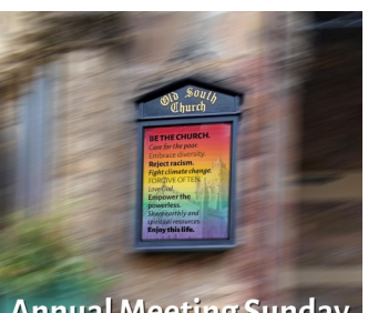
Annual Meeting Sunday